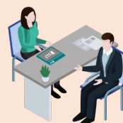
Registration Service Counters

Applicants should bring along mobile phone with biometric authentication functions (e.g. facial / fingerprint identification) and Hong Kong Identity Card for in-person upgrade at iAM Smart registration service counters or self-registration kiosks * located in each district.